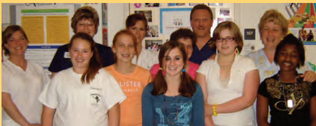
TOP: Future Nurses at Somerset Intermediate School with PRMC Nurses