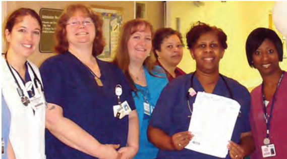
Members of the PRMC Nursing Staff

Staff in the Nursing Department at Peninsula Regional – nurses, certified nursing assistants and patient care technicians – are all participating in hourly patient rounding which began on April 15th. Research shows that healthcare facilities that use focused hourly rounding have: